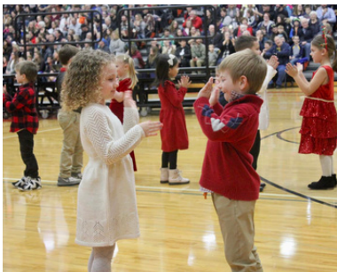
Two kindergarten students perform a partner routine in the opening dance sequence of their Christmas concert.