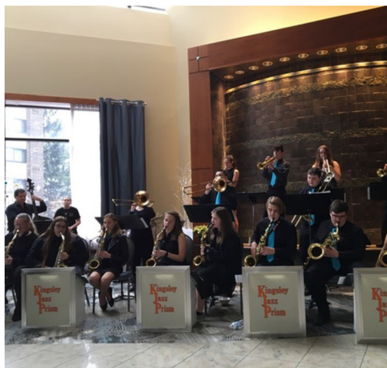
The Jazz Prism performs holiday songs at the Grand Traverse Resort on December 18, 2021.

We are open!! Call today for an appointment. 231.263.5895